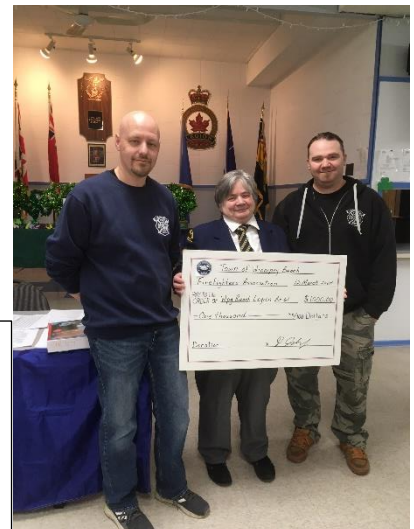
Winnipeg Beach Firefighters donation of $1000 towards our Winnipeg Beach School Lunch with Santa and gifts for the children!