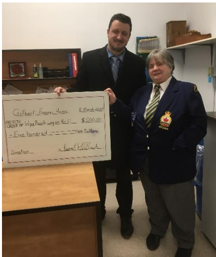
Gilbert Funeral Home donation of $500 towards our new office desks!